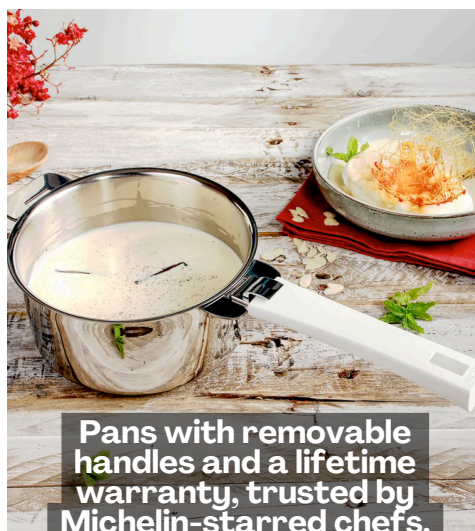
Pans with removable handles and a lifetime warranty, trusted by Michelin-starred chefs.