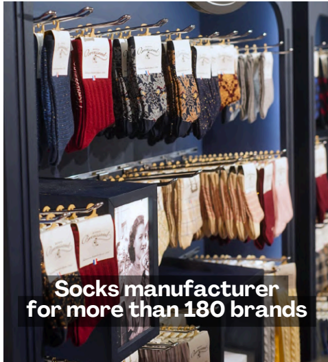
Socks manufacturer for more than 180 brands