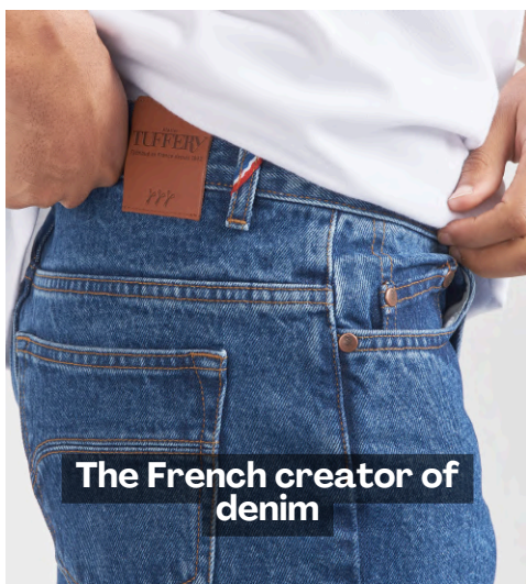
The French creator of denim