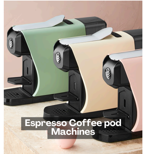
Espresso Coffee pod Machines