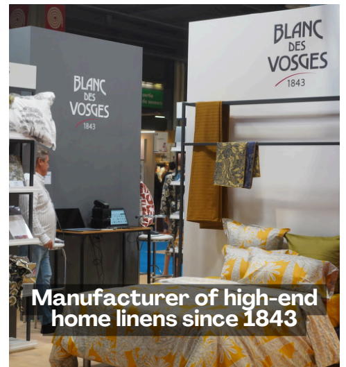
Manufacturer of high-end home linens since 1843