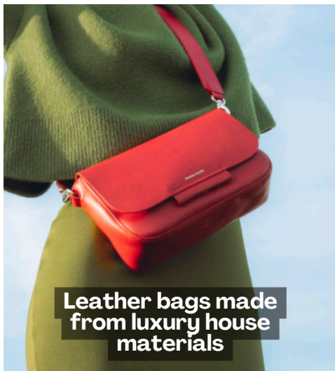
Leather bags made from luxury house materials